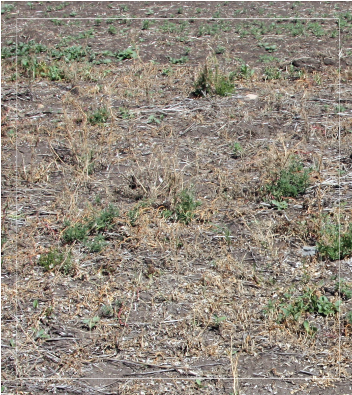
Roundup Xtend® herbicide with VaporGrip® Technology at 2 L/ac.

Source: 35 days after application in Carseland, AB 2019.