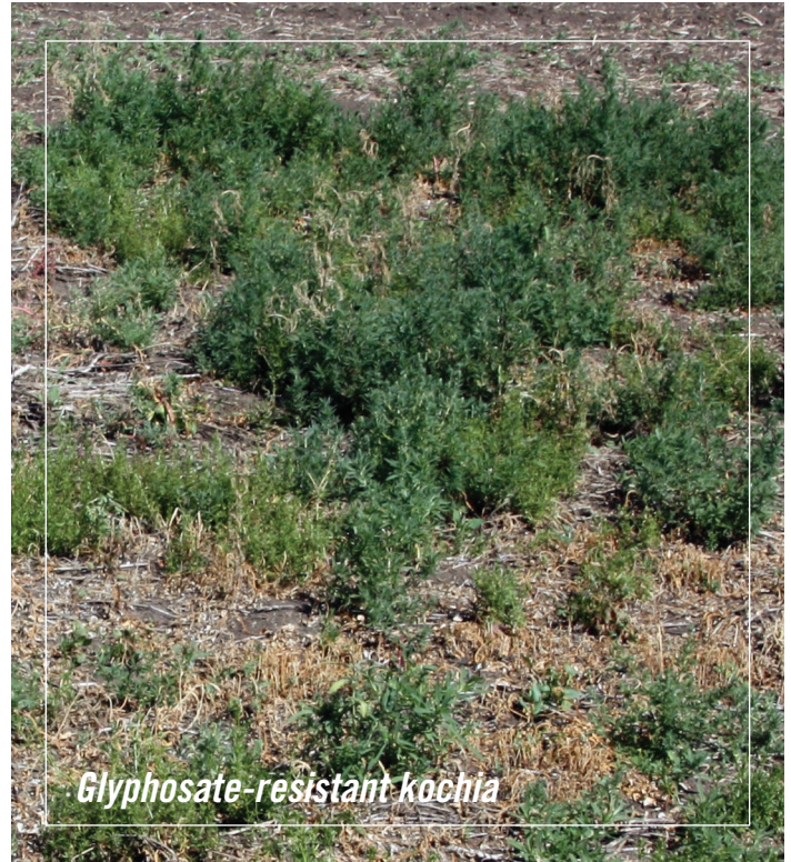
Enlist Duo™ at 1.72 L/ac.

Source: 35 days after application in Carseland, AB 2019.